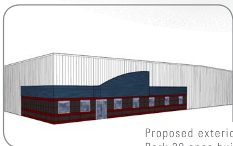
Proposed exterior design for Park 30 spec building